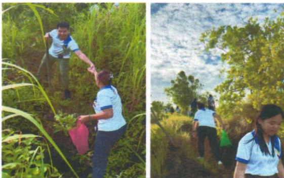
In photos: PSA Siquijor personnel during their journey to the planting site.

PSA Siquijor continues to extend its support and commitment to environmental causes, reinforcing its contribution to Siquijor's overall progress beyond its statistical functions.