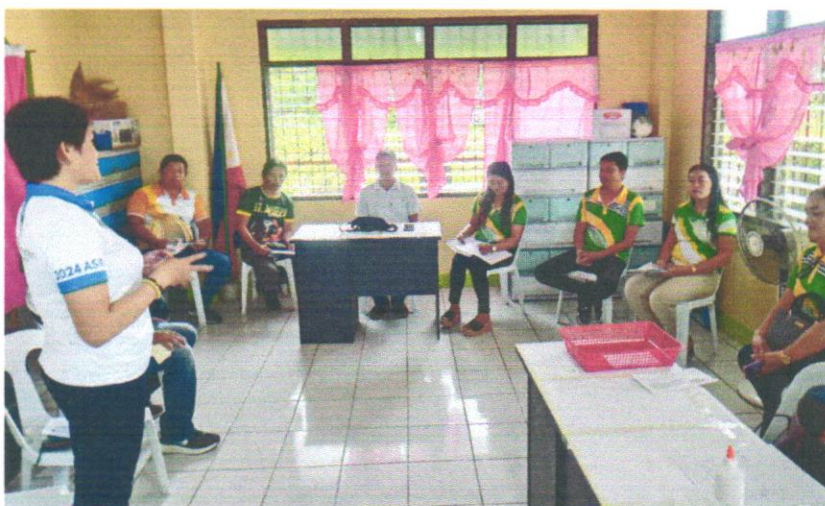
At Brgy Lilo-an in Maria, Siquijor during their scheduled meeting on 27 June 2025.

The Philippine Statistics Authority (PSA) is conducting regularly the Quarterly Municipal Fisheries Survey (QMFS). This aims to generate volume and value of municipal fisheries production by species at the provincial, regional, and national levels. This is in accordance with Republic Act (RA) No. 10625 (Philippine