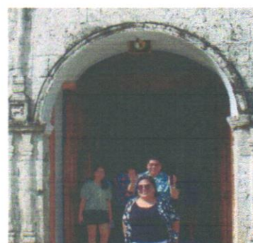
Lakbay-Aral visit at the historical Simbahan ng Siquijor