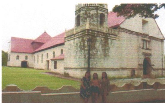
Participants visit the historic Lazi Church, one of Siquijor's treasured heritage sites.

On the third and final day of the activity, it concluded with a Lakbay-Aral. It is a cultural and historical tour across Isla del Fuego (Siquijor), which allowed participants to explore and visit the province's famed and iconic historical landmarks and local heritage. The tour offered a refreshing and educational break from formal sessions, with participants enthusiastically learning about the island's unique stories and significance in Philippine history.