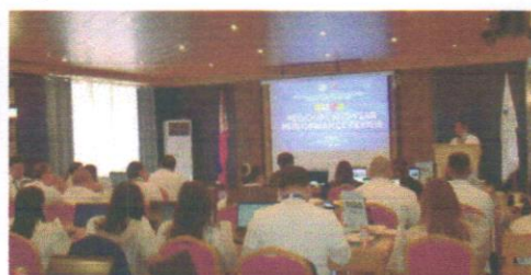
SuSS/OIC Maghanoy as he welcomed the participants and led the discussion.

On the third and final day of the activity, it concluded with a Lakbay-Aral. It is a cultural and historical tour across Isla del Fuego (Siquijor), which allowed participants to explore and visit the province's famed and iconic historical landmarks and local heritage. The tour offered a refreshing and educational break from formal sessions, with participants enthusiastically learning about the island's unique stories and significance in Philippine history.