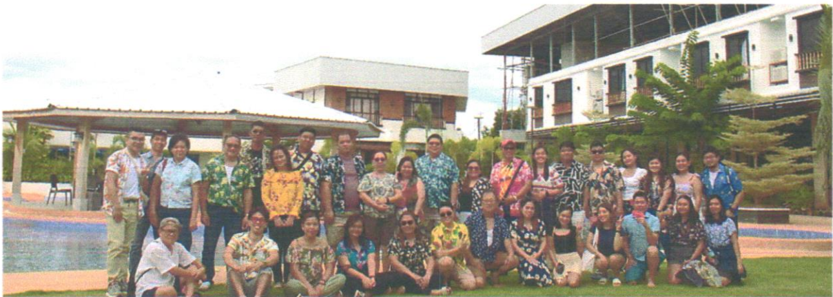
Participants of the 1st Regional Mid-Year Performance Review under NIR, dressed in floral attire, happily posed for a photo before starting the Lakbay-Aral in Isla del Fuego.

The Philippine Statistics Authority (PSA) proudly conducted the first Regional Mid-Year Performance Review under the newly formed Negros Island Region (NIR) from 14-16 July 2025, showing a united effort to improve statistical work in the region.