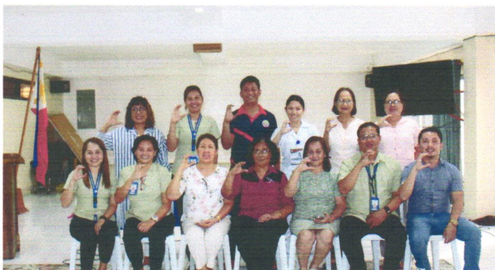
PSA Siquijor lecturers with LGU Enrique Villanueva officials in a group photo, proudly posing with the 'C' hand sign to represent CBMS

The Philippine Statistics Authority (PSA) Siquijor successfully conducted the presentation of the preliminary results of the 2024 Community-Based Monitoring System (CBMS) for the Municipality of Enrique Villanueva on 22 July 2025.