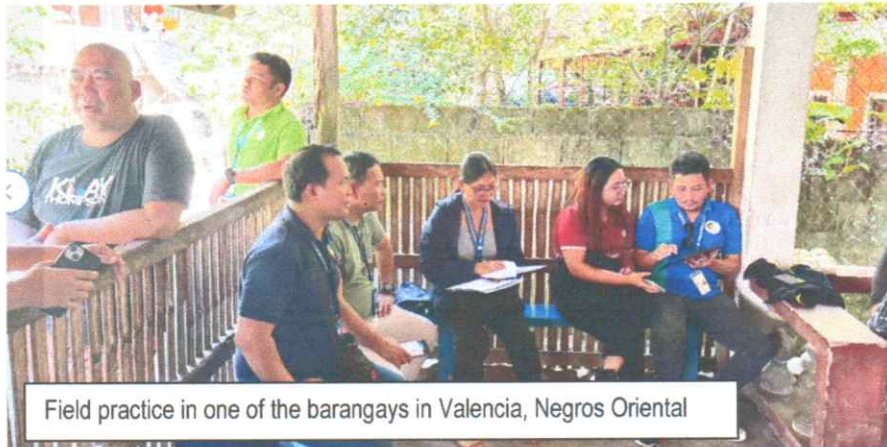
Field practice in one of the barangays in Valencia, Negros Oriental

The 2025 ULAFO-LMFLC aims to determine the number of agricultural operators, determine the type of agricultural activity operated such as growing of crops and raising of livestock and/or poultry, thus, obtain