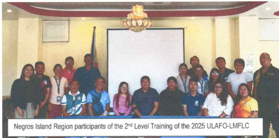
Negros Island Region participants of the 2 nd Level Training of the 2025 ULAFO-LMFLC

Fish Landing Centers (ULAFO-LMFLC) are on its way on August 2025 that aims to collect data and information on all agricultural activities, inland fishing, and landing centers in the whole country. The information will be used for the continuous development of sampling frame for quarterly agricultural and fisheries surveys.