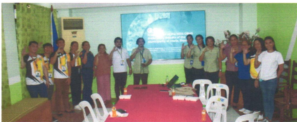
PSA Siquijor lecturers with LGU Maria department heads and representatives in a group photo after the presentation of the preliminary results of 2024 CBMS

The Philippine Statistics Authority (PSA) Siquijor Provincial Statistical Office (PSO) successfully presented the preliminary results of the 2024 Community-Based Monitoring System (CBMS) to the Local Government Unit (LGU) of Maria on July 31, 2025.