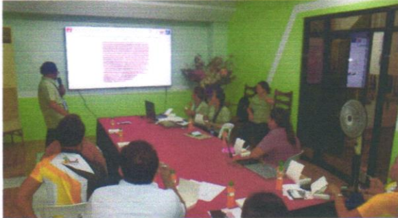
SuSS/OIC Maghanoy presented the preliminary results of the 2024 CBMS

employment, housing, and access to basic services, the critical indicators that reflect the well-being of the local population.