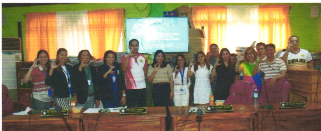
PSA Siquijor lecturers with LGU Siquijor department heads and representatives in a group photo after the presentation of the preliminary results of 2024 CBMS

The Philippine Statistics Authority–Siquijor presented the preliminary results of the 2024 Community-Based Monitoring System (CBMS) for the Municipality of Siquijor on August 8, 2025, at the Sangguniang Bayan Session Hall of the Local Government Unit (LGU) of Siquijor.