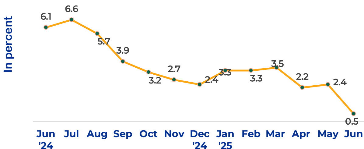
Figure 2. Headline Inflation Rates in Bacolod City, All Items (2018=100)