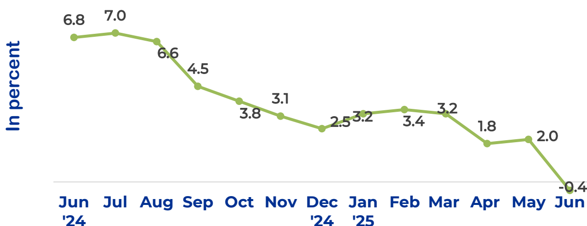
Figure 2. Inflation Rates for the Bottom 30% Income Households in Bacolod City, All Items (2018=100)